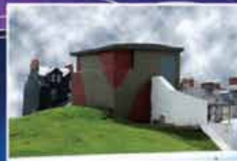
Battery Command Post and rangefinder

THIS TABLET MARKS THE PLACE WHERE THE FIRST SHELL FROM THE LEADING GERMAN BATTLE CRUISER STRUCK AT 9:10 A.M. ON THE 16 TH OF DECEMBER 1914 AND ALSO RECORDS THE PLACE WHERE (DURING THE BOMBARDMENT) THE FIRST SOLDIER WAS KILLED ON BRITISH SOIL BY ENEMY ACTION IN THE GREAT WAR 1914-1918