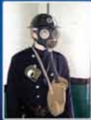
Museum and displays