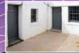
Underground Magazines and Stores

Used to store over 1 000 shells and cartridges for the powerful 6 inch guns