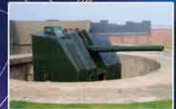
WW2 Emplacement Number 2 Gun