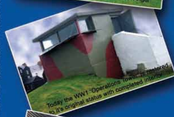
Today the WW1 'Operations Tower' is restored to its original status with completed interior