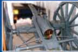
Workshop Gun Restoration