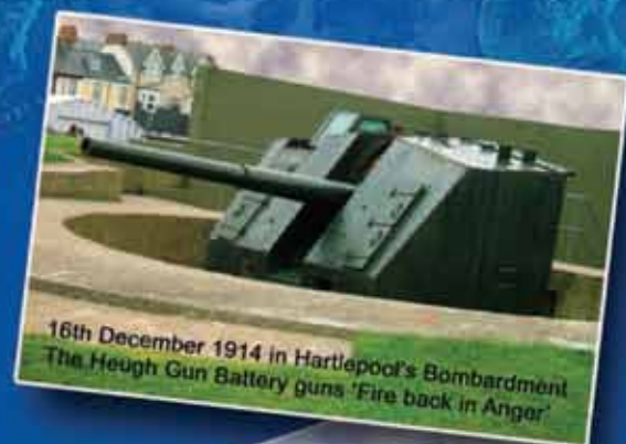
16th December 1914 in Hartlepool's Bombardment The Heugh Gun Battery guns 'Fire back in Anger'

Just before Christmas 1914 Britain had her first taste of Total War. Three German Battle cruisers emerged from the dawn mist to 'screw forth their venom' on the people of Hartlepool. Over a thousand shells were fired killing 114 men, women and children. For 45 minutes the volunteer gunners of the Heugh Battery fought back.