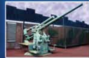
3.7 inch Malta Gun