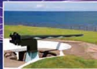
WW1 Emplacement Number 1 Gun