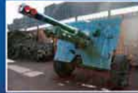
25 Pounder Field Gun